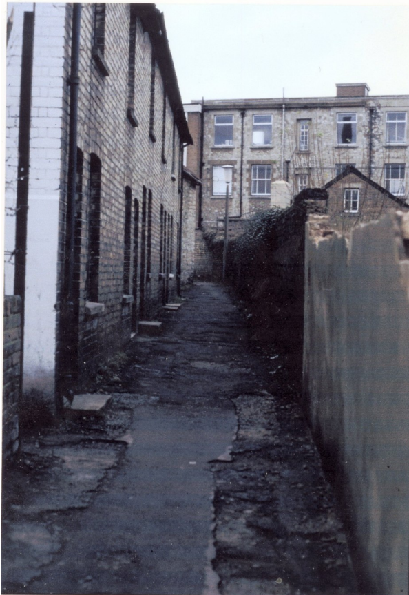
1 ALMA PLACE

ALMA PLACE was completed by 1868 and was demolished c.1980. CANARY COTTAGE is on the right side behind the wall and was the gardener's cottage for Ivymeath In the 1951, 1978 and 1983-4 Electoral registers it is called Alma Road