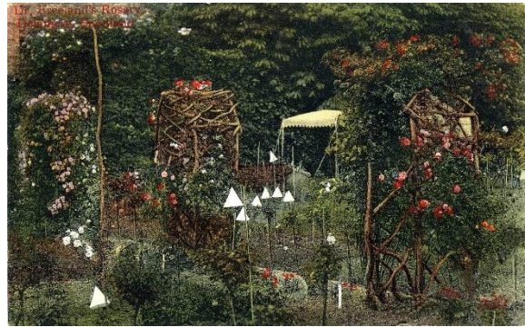
Part of the garden of Delamere.